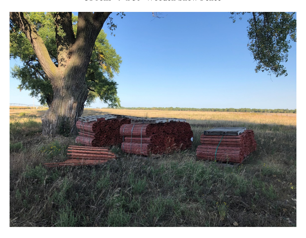
51 rolls- 4' x 50' Wooden Snow Fence